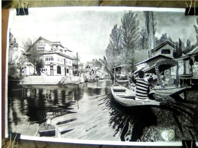
FIGURE 8 ILLUSTRATED BY K. CHAWINGA

And when the bell rings, the heart still echoes with the lessons we've shared.