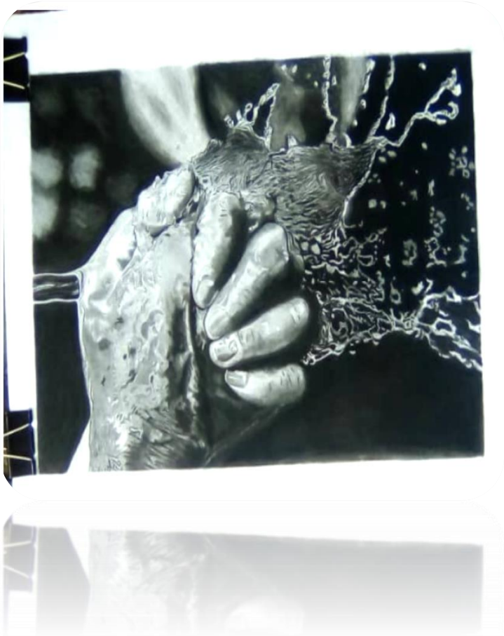
FIGURE 2 ILLUSTRATED BY K. CHAWINGA