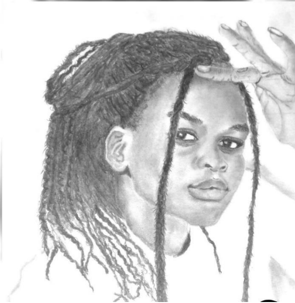
FIGURE 3 ILLUSTRATED BY K. CHAWINGA