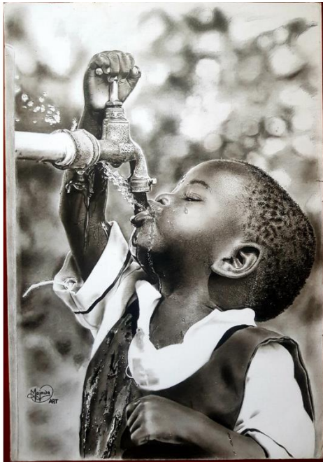
FIGURE 5 ILLUSTRATED BY K. CHAWINGA