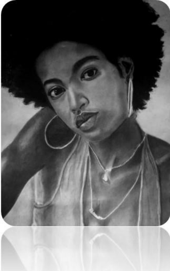
FIGURE 4 ILLUSTRATED BY K. CHAWINGA