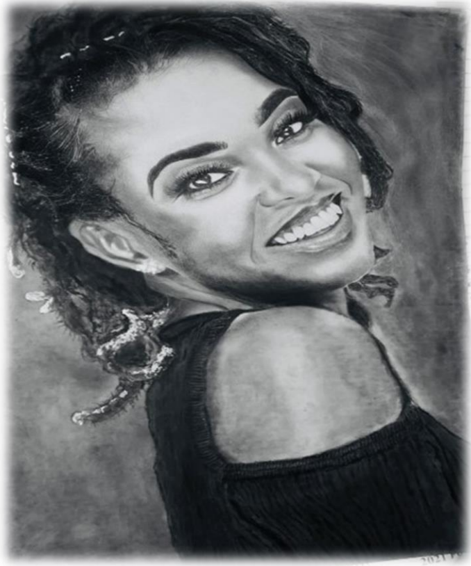
FIGURE 7 ILLUSTRATED BY K. CHAWINGA