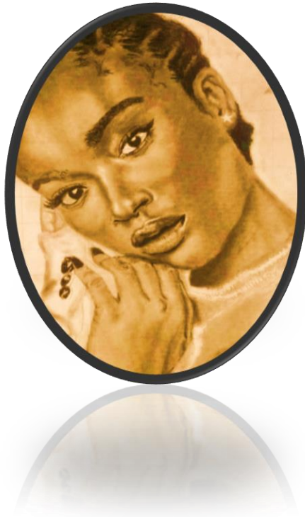
FIGURE 6 ILLUSTRATED BY K. CHAWINGA

mean forgetting the laughter, smiles, and the joy of little things we took for granted. I want to shelve those memories, keep them safe and relive them like a fully stocked breathing library of lost memories.